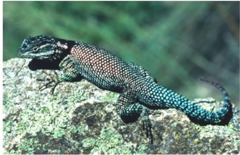
Mountain Spiny Lizard