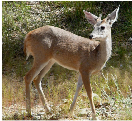
Coues' White-tailed Deer