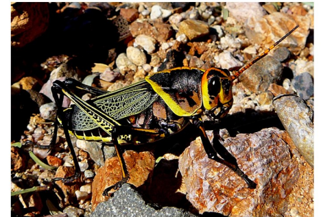
Horse Lubber Grasshopper