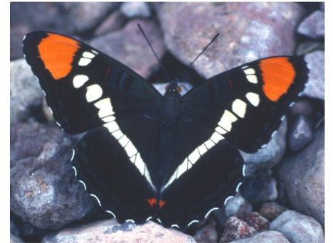
Arizona Sister Butterfly