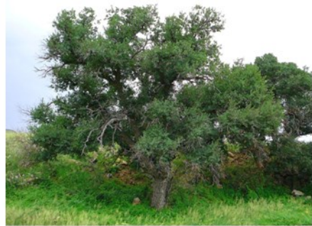
Mexican Blue Oak