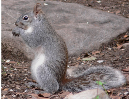
Arizona Gray Squirrel